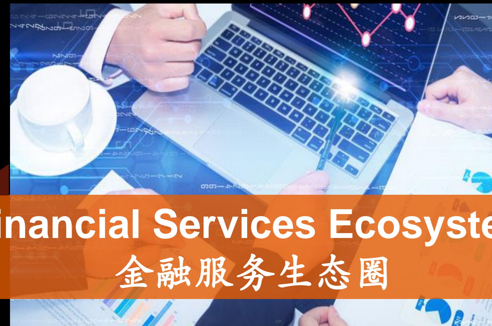
Financial Services Ecosystem 金融服务生态圈