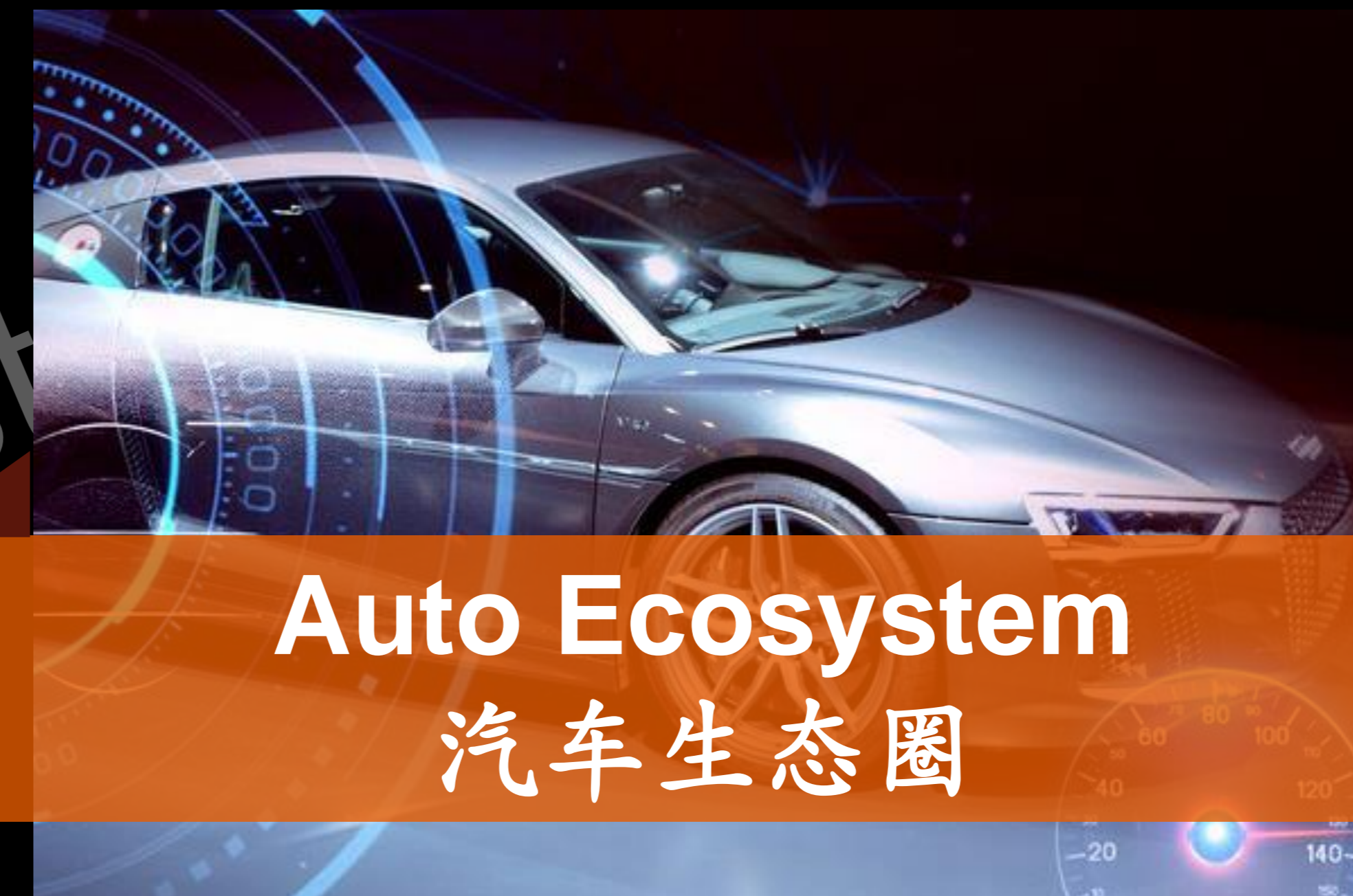
Auto Ecosystem 汽车生态圈