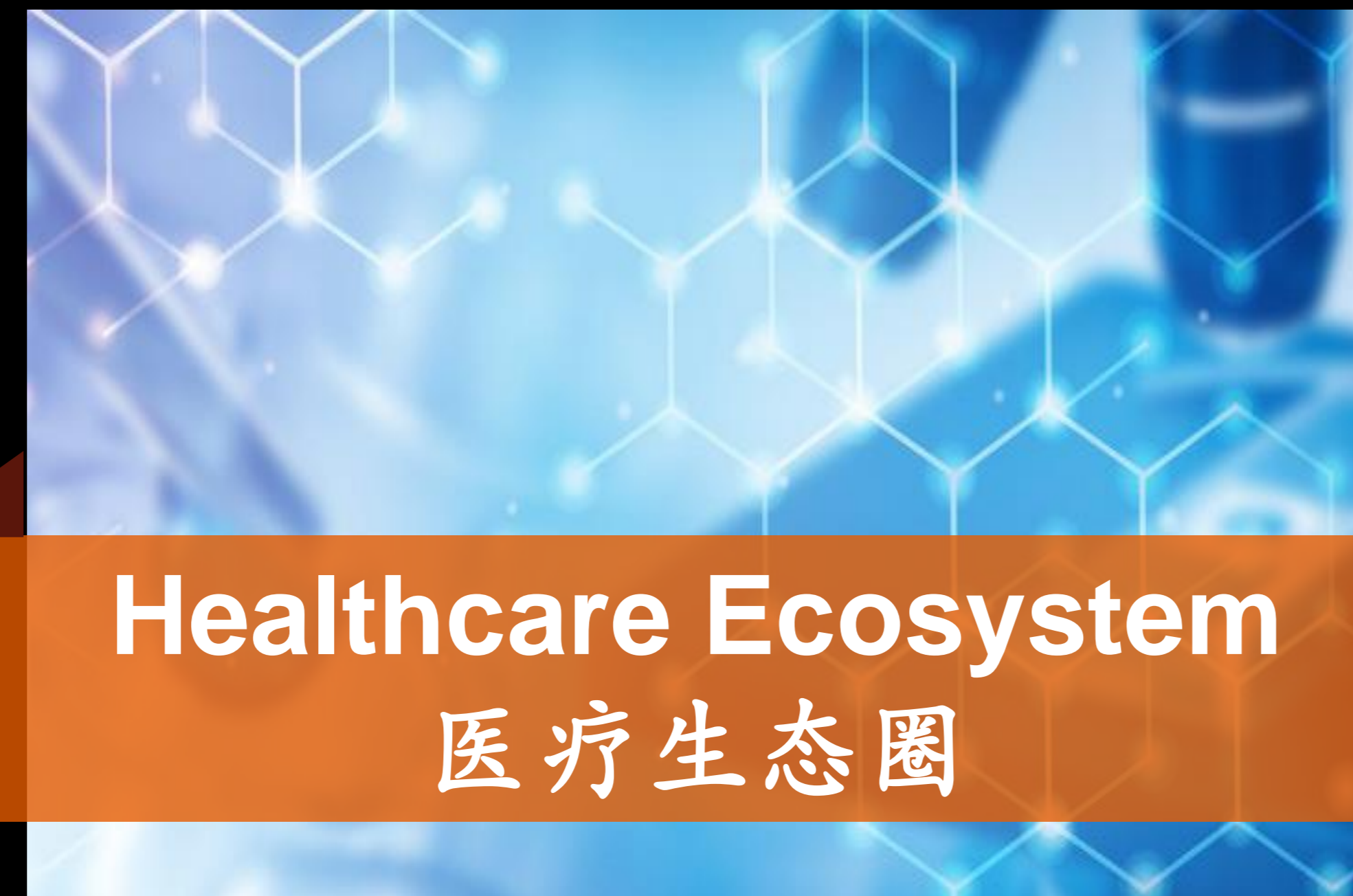
Healthcare Ecosystem 医疗生态圈