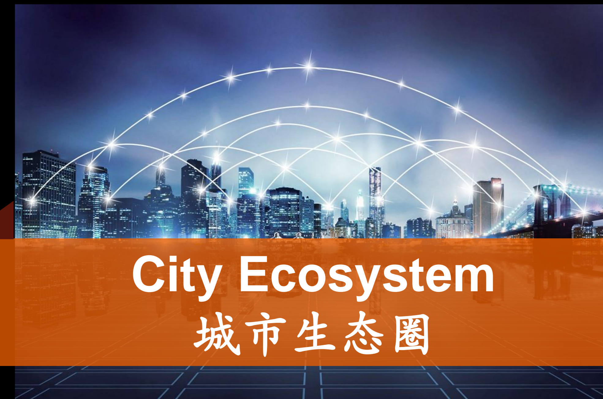
City Ecosystem 城市生态圈